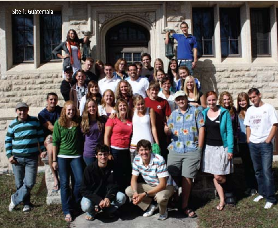
Site 1: Guatemala