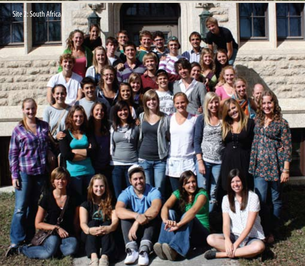
Site 2: South Africa