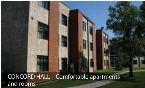
CONCORD HALL – Comfortable apartments and rooms