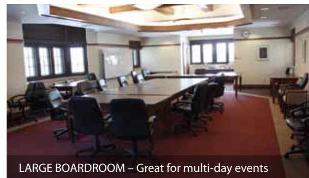
LARGE BOARDROOM – Great for multi-day events