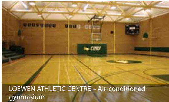
LOEWEN ATHLETIC CENTRE – Air-conditioned gymnasium