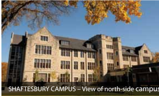
SHAFTESBURY CAMPUS – View of north-side campus

Canadian Mennonite University 500 Shaftesbury Blvd. Winnipeg, MB Canada R3P 2N2