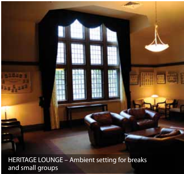
HERITAGE LOUNGE – Ambient setting for breaks and small groups