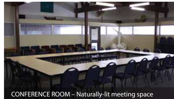
CONFERENCE ROOM – Naturally-lit meeting space