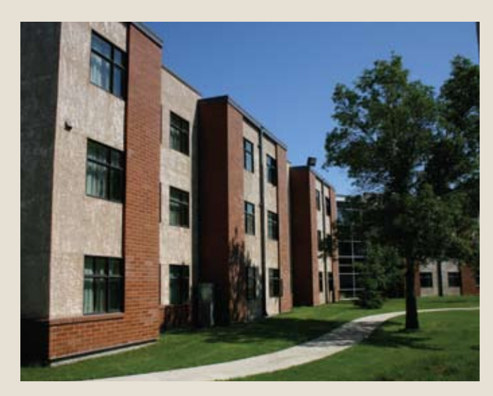
Concord Hall, opened August 2005

A new university that amalgamates two colleges and dreams of growth calls for adequate living space. In January, 2000 MCF purchased a 20-acre property, complete with an historic building, from the Province of Manitoba. What a beautiful and dignified addition to the existing 20-acre Shaftesbury campus! But the purchase came with a formidable challenge. The buildings required an extreme internal makeover at a cost of $6 million. Renovations were undertaken immediately, with completion during the 2000-2001 academic year.