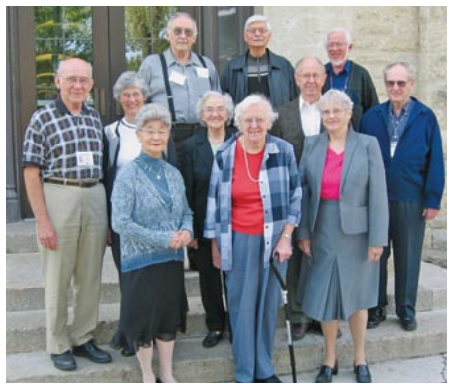
50 year reunion classes of MBBC and CMBC at the 2006 Homecoming Celebration.