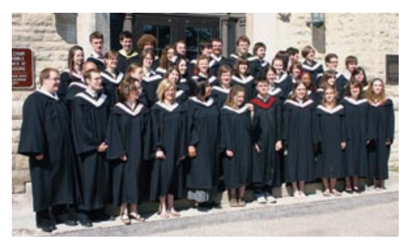
CMU's class of 2007: Witnesses who point to God.